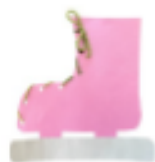
Ice Skate Craft Mar 3 to Mar 15